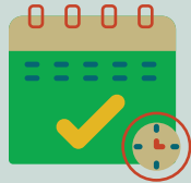
Enhancement of Communication Skills